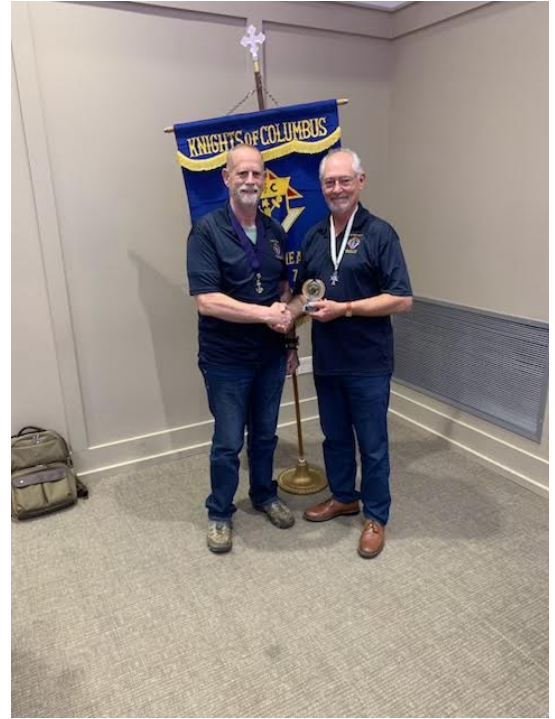
Knight of Month—April