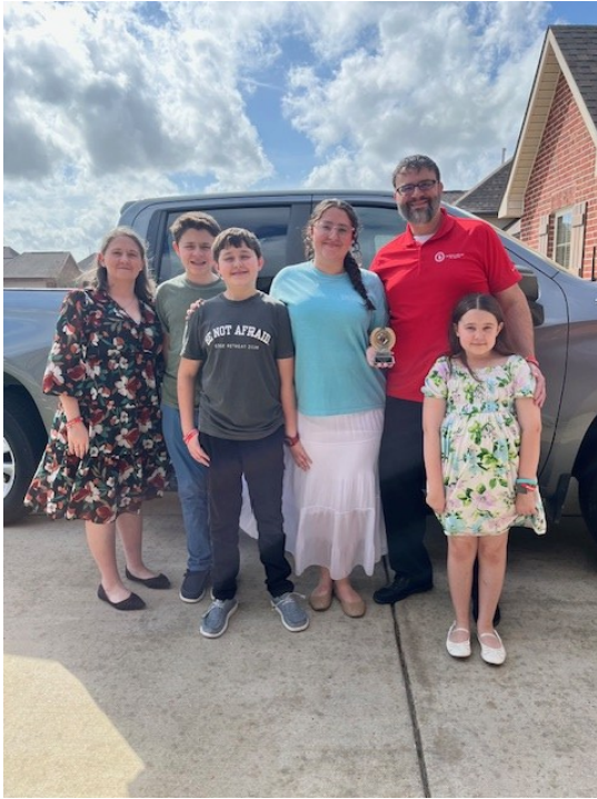
Family of the Month- March