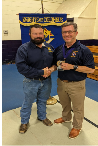
Family of the Month