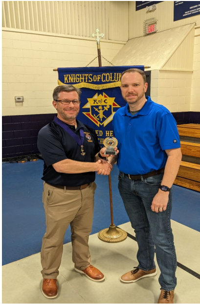
Knight of the Month