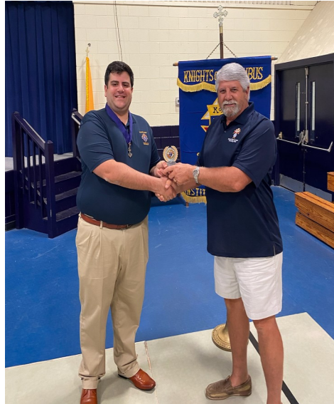
KC 7557 in Honduras Council Donation toward Medical Kits